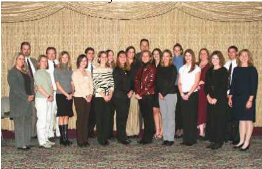
Pictured at left are Alpha Eta members from Texas Tech University Health Sciences Center, Lubbock, TX. The banquet was held October 30, 2002.